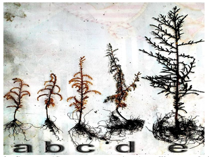
Fig. 2: Cypress ( Cupressus sempervirens ) seedlings, aged 6 months old, recovered from DF disease (a), uninoculated control (b), inoculated with R. solani and amended with fungicide (c), dual inoculated (EM and DF fungi) and inoculated seedling with Agaricus sp (e).