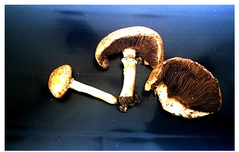
Fig 1: Fruit bodies of Agaricus sp.